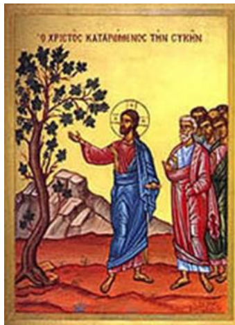
Jesus teaching the disciples about trees and their fruit

+ IN THE NAME OF GOD THE FATHER, AND OF THE SON, AND OF THE HOLY SPIRIT. AMEN.