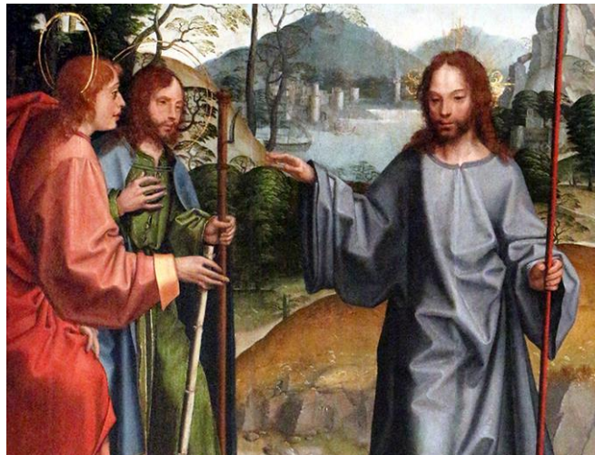
Jesus calls James and John, the sons of Zebedee

18 And Jesus, walking by the sea of Galilee, saw two brethren, Simon called Peter, and Andrew his brother, casting a net into the sea: for they were fishers. 19 And he saith unto them, Follow me, and I will make you fishers of men. 20 And they straightway left their nets, and followed him. 21 And going on from thence, he saw other two brethren, James the son of Zebedee, and John his brother, in a ship with Zebedee their father, mending their nets; and he called them. 22 And they immediately left the ship and their father, and followed him.